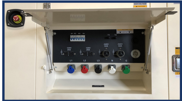
CUSTOMER CONNECTION PANEL