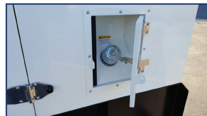
LOCKABLE EXTERNAL FUEL FILL