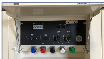
CUSTOMER CONNECTION CAM-LOK STANDARD