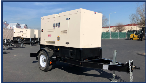
LARGE CAPACITY 90 GAL FUEL CELL

UQ45H-T4f: Standby Rating: 45kVA / 37.5kW Prime Rating: 43kVA / 36kW