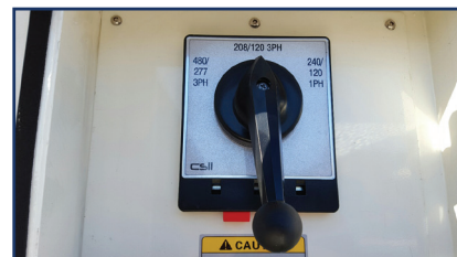
3 POSITION VOLTAGE SELECTOR SWITCH